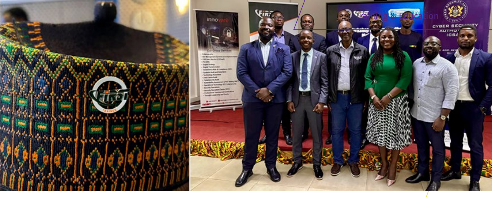
Ghana CSA: CNIIP TTX